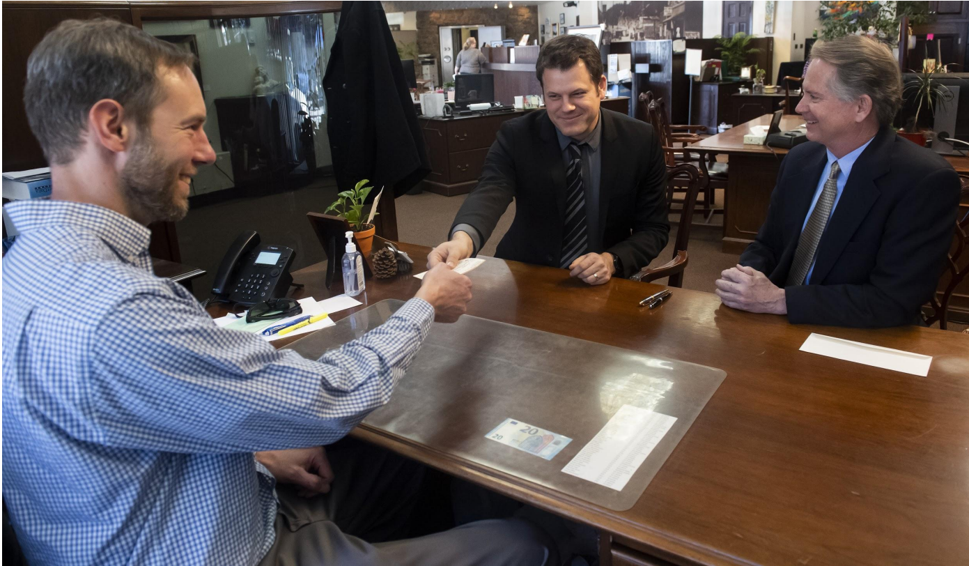
Paying off the mortgage at Evergreen National Bank.